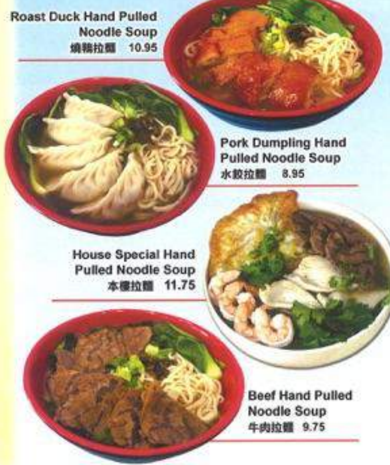
Roast Duck Hand Pulled Noodle Soup 燒鴨拉麵 10.95