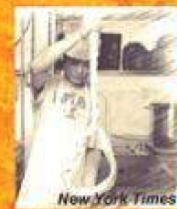
New York Times